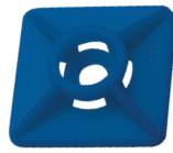
PA 6.6 DT