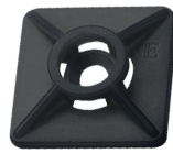
PA 6.6 UV